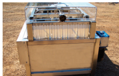
Top: Top and side brushes. Right: Fixed position jet system. Above: Williames Stainless Steel Tray Washer.