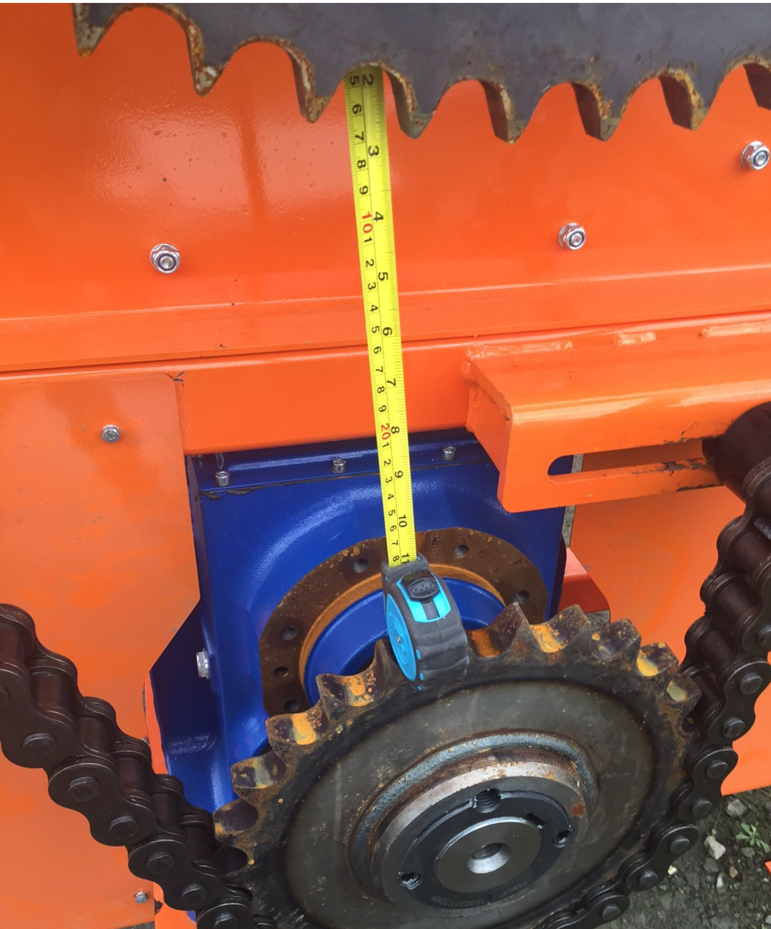
OUTBOARD TRANSMISSION DRIVE