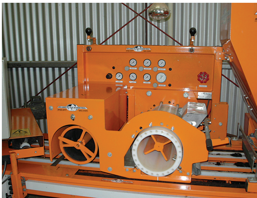
Top: Williames 750 Seeding Line. Above: Williames 750 Seeder. Right: Precise sowing.