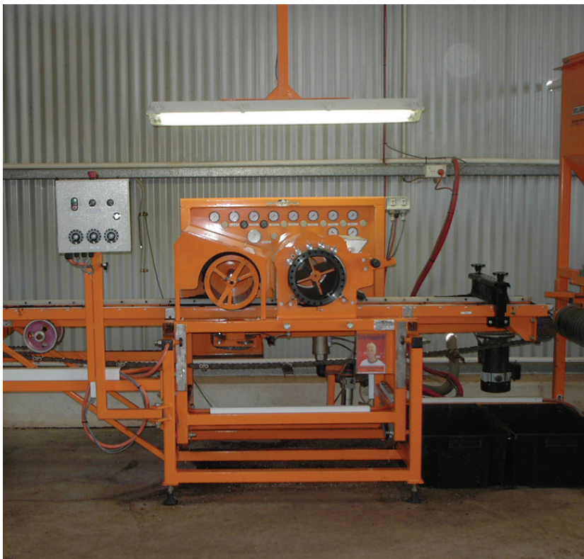
Top: Williames 1500 Seeding Line with optional soil deliver system & tray de-stacker. Above: Williames 1500 Seeder. Right: Precise sowing.