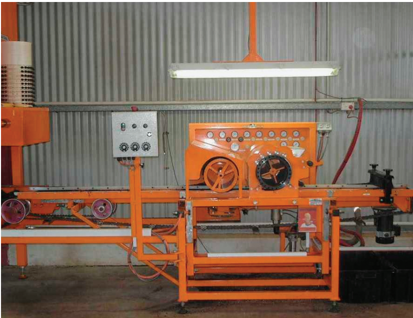
Top left: Multi-singulator bars. Top right: Precise sowing. Right: Sows a variety of seeds.